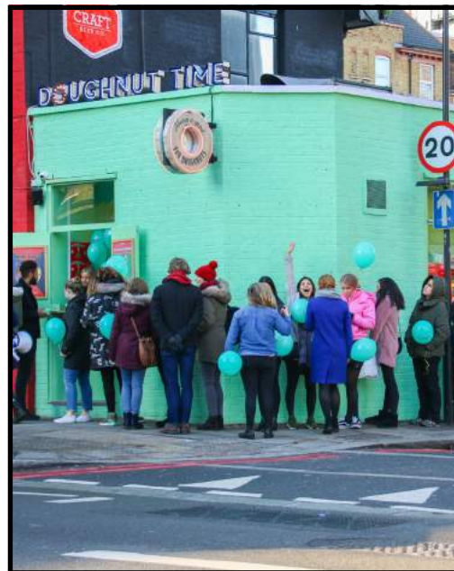
SHOREDITCH OLD STREET