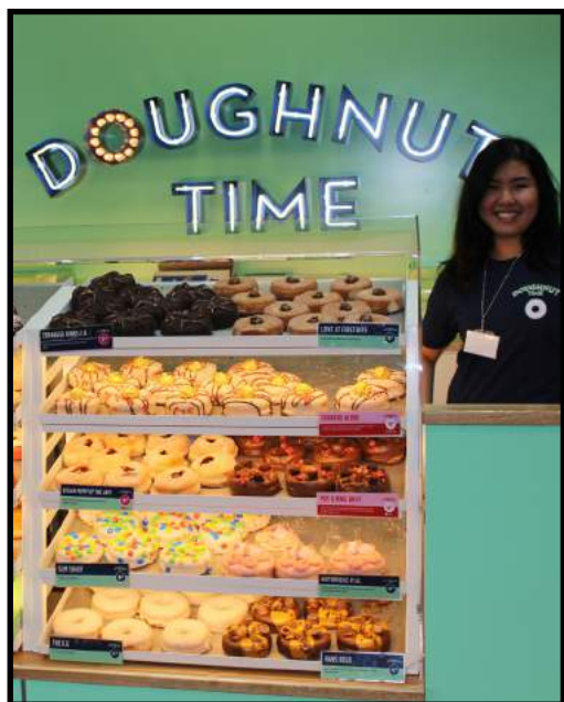
LONDON CITY AIRPORT