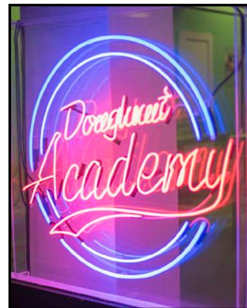
OLD ST POP-UP